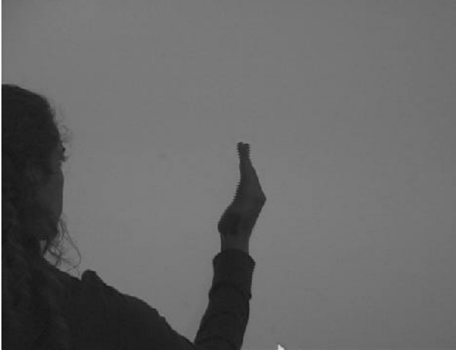
FIGURE 3: A user touches the SMARTBoard with a “vertical edge” posture. The current recognized postures are one finger, two fingers, a vertical edge, a horizontal edge, and a palm.

containing twelve rows of eight 16mw/str SLI-0308CP LEDs, pulsed at 200mA. Centered between the light sources approx 3m from the board, is a Marshall V1070 video camera (resolution 811 x 510 pixels) with an IR filter, and an 8-80 mm motorized lens, specially adjusted to focus with IR light (Figures 1 and 2). A standard video digitizing card is used to capture the image from the camera.