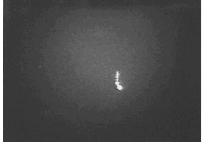
FIGURE 4: Camera image of the user’s hand on the rear of the board. After thresholding, the image is processed to produce characteristics of the area, such as vertical-to-horizontal ratio and perimeter-to-area ratio, which are used in posture recognition.

When the user touches the display, we first identify which pixels in the video image correspond to his or her hand by